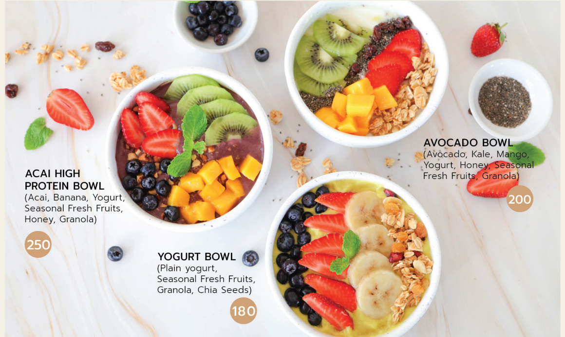
ACAI HIGH PROTEIN BOWL 250 (Acai, Banana, Yogurt, Seasonal Fresh Fruits, Honey, Granola)