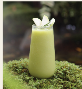
Green Morning Smoothie 150 (Avocado, Green Apple, Kale, Mint leaves, Lemon)