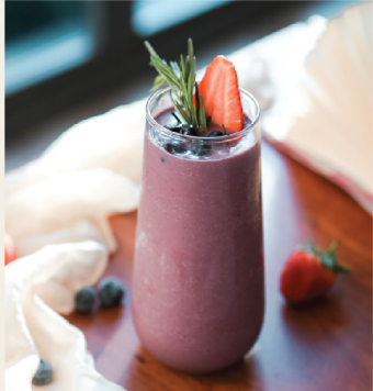
Acai High Protein and Fiber Smoothie 200 (Acai, Banana, Yogurt, Honey)