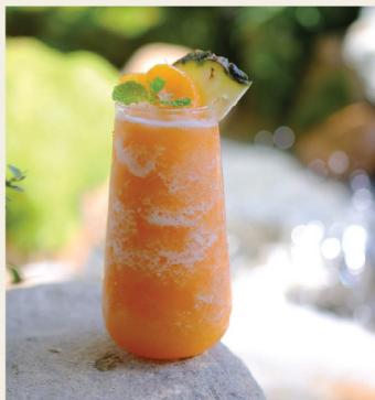
Refreshing Sunrise Smoothie 120 (Carrot, Orange, Pineapple, Mango)