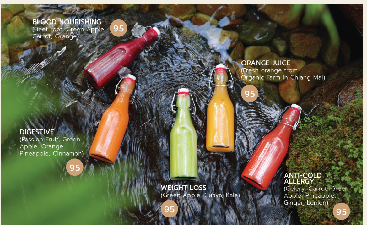
BLOOD NOURISHING 95 (Beet root, Green Apple, Carrot, Orange)