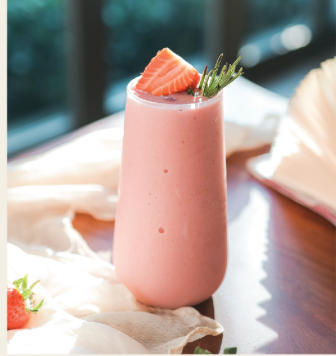
Strawberry and Banana Smoothie 120 (Strawberry, Banana, Fresh Milk)