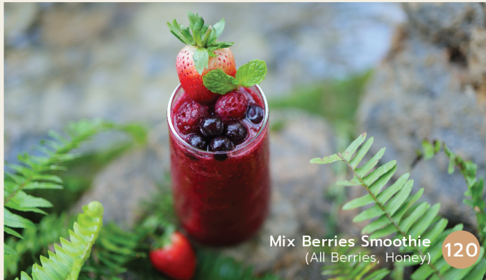
Mix Berries Smoothie 120 (All Berries, Honey)